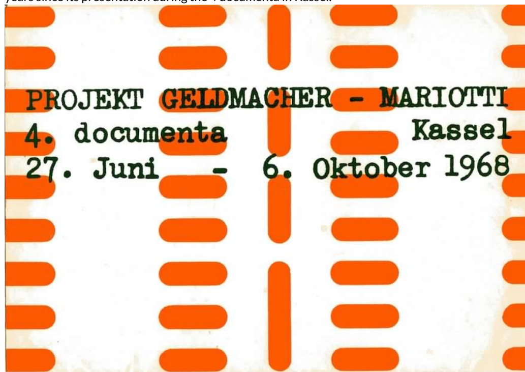
Image: Link ( http://www.mariotti.ch/de/expositions/1968/p/ ) zum ( http://www.mariotti.ch/de/expositions/1968/p/ ) Projekt "Projekt Geldmacher-Mariotti, Kassel" ( http://www.mariotti.ch/de/expositions/1968/p/ )